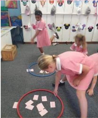
Odd and even Numbers with Hula-Hoops!

Using concrete apparatus to learn new Mathematical concepts in Grade 2